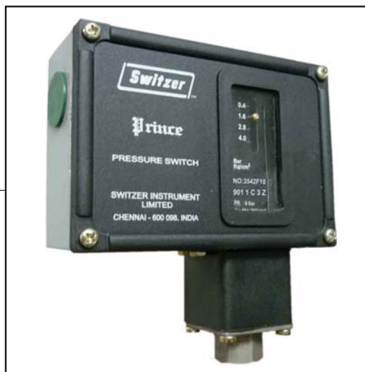
PRINCE 901 IN GH ENCLOSURE

This compact version in Switzer series 900 Pressure Switches using components of high reliability is specifically designed for OEMs.